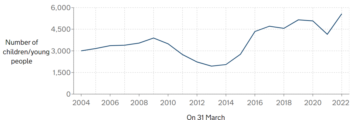
Figure 1- Graph showing numbers of UASC claiming asylum in England from 2004 to March 2022 xvi

The majority of UASC are male (95%) and over the age of 16 years (87%) xvi . 88% of UASC have a primary need of ‘absent parenting’, with 7% needing help due to abuse or neglect and 4% due to acute stress in their family. xvi